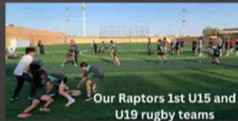
Our Raptors 1st U15 and U19 rugby teams in over 3 years!

ADEK Cup, JrNBA, Rugby, Football, Netball, Swimming, Triathlon, Waterpolo and Cricket - our Raha Raptors have been busy this term!