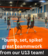
"bump, set, spike! great teamwork from our U13 team!"