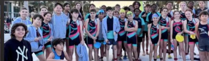
72 Raha Triathletes participated in the ADEK cup! Over 21 podium finishes!