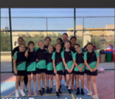
U11's first netball games - coming out with 2 wins!