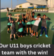
Our U11 boys cricket team with the win!