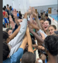
1st place in ADISSA Swimming!