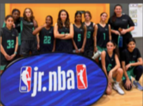
JrNBA Girls and Boys teams qualified for the tournament!