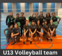
U13 Volleyball team