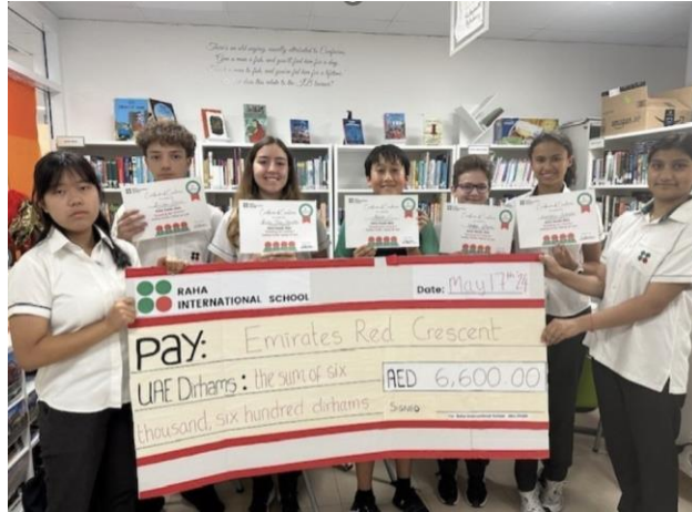
5 - PYP students with their sponsorship certificate.