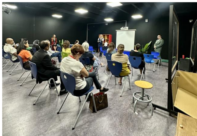
10 - G10 Parent meeting, an interesting discussion about the needs for a smoother transition to DP.