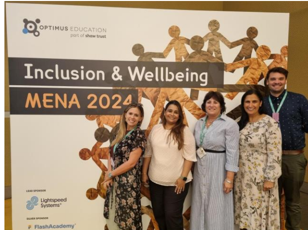
7 - Great workshops to support our students!