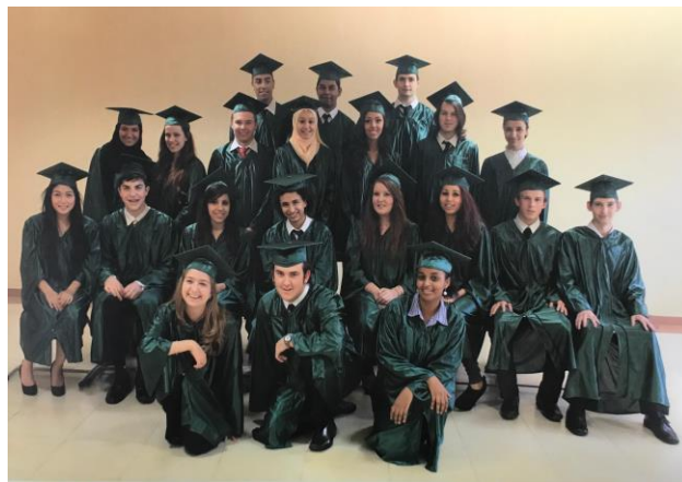
6 - Where are they today? Class of 2011

Please click the LINK to start connecting or share it with any alumni.