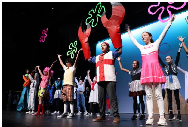
12 - Amazing performances at the SpongeBob Musical