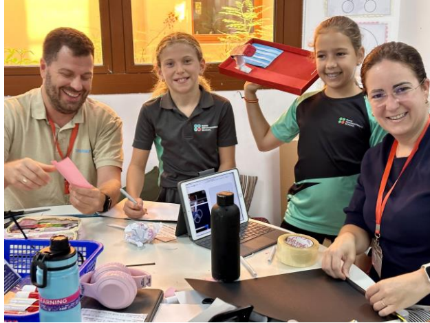
14 - Parents were here last week to help.