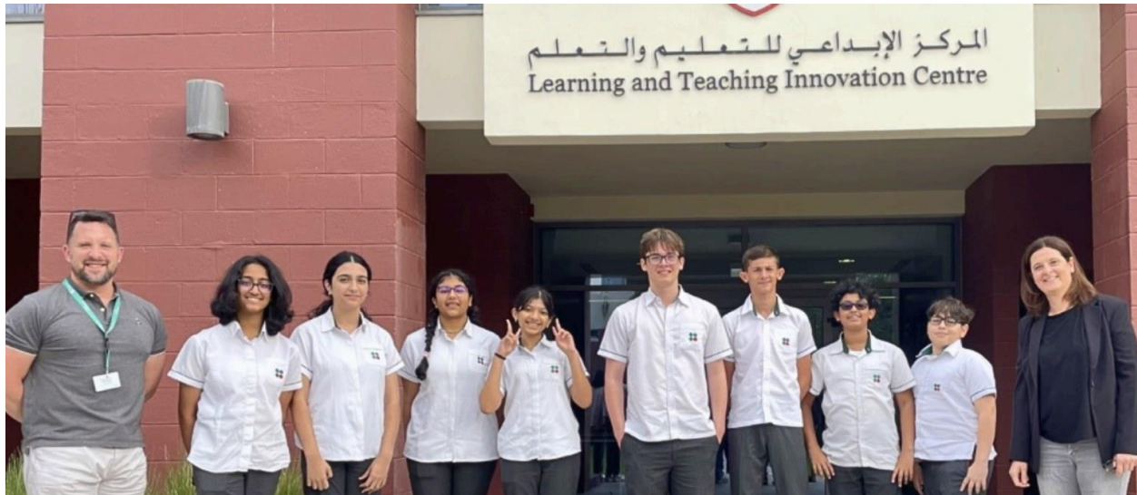
9 - Congrats to the students who qualified for London 2024 European Championships!

We congratulate these students for all their hard work and effort over the past several months in preparing for the achievement of these great successes and look forward to London, 2024. Read the full article HERE .