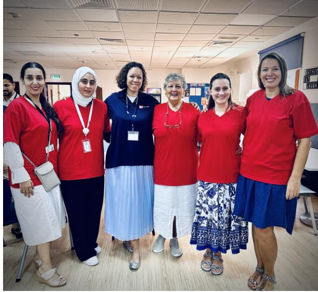
11 - We are recognized our volunteer parents at the PT General Meeting.