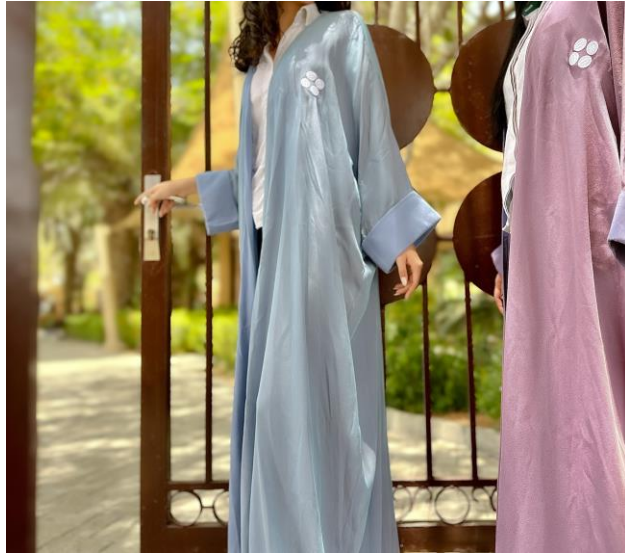
8 - Thobes at Gate 1