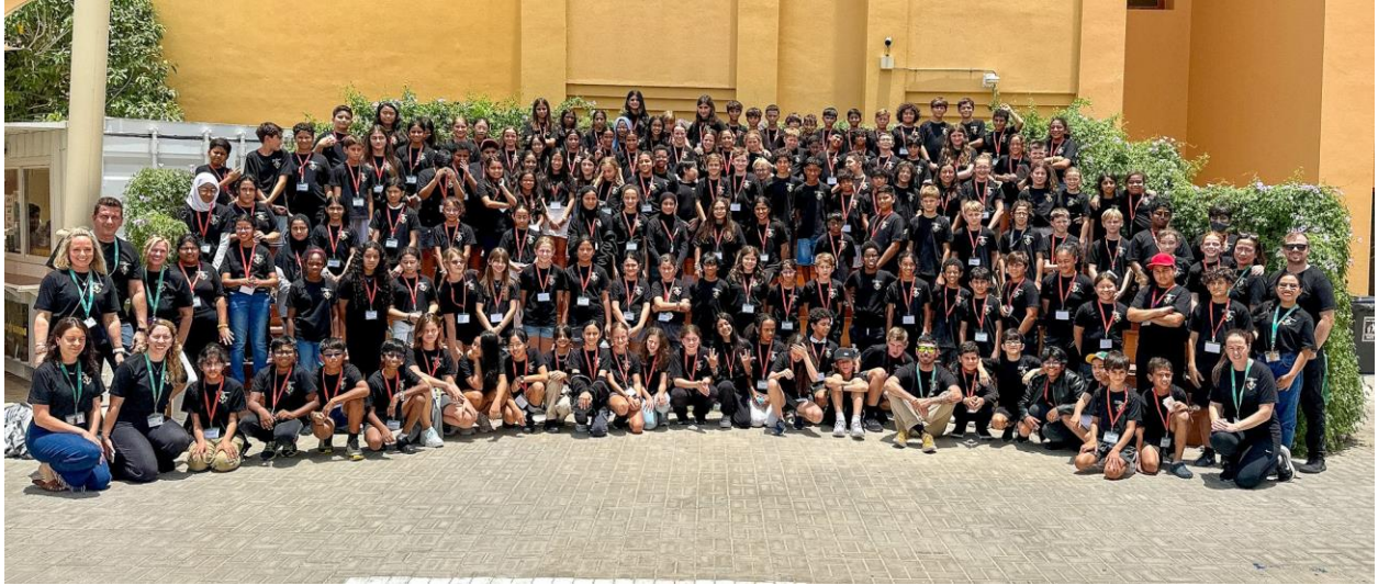
13 - PYPx Team!