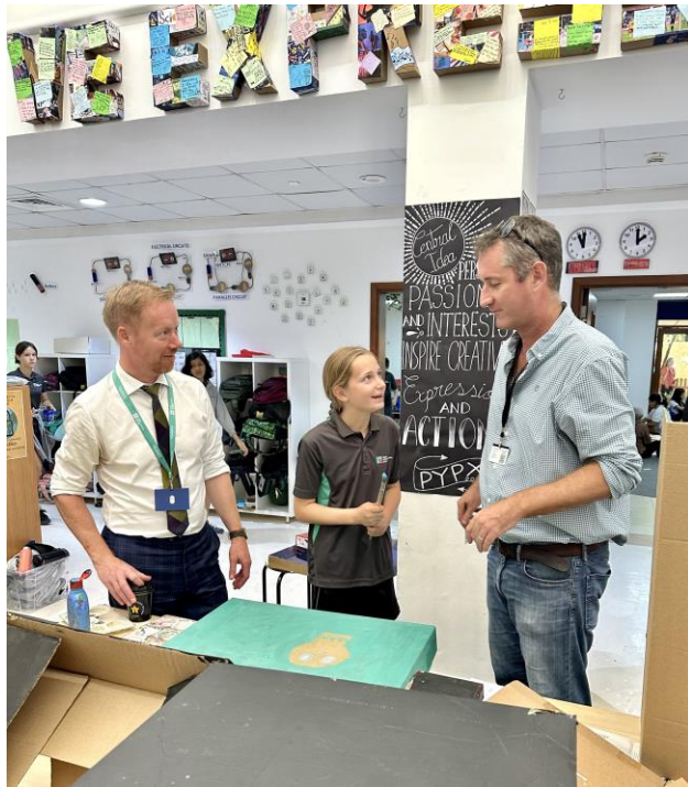
15 - What is your PYPx about?