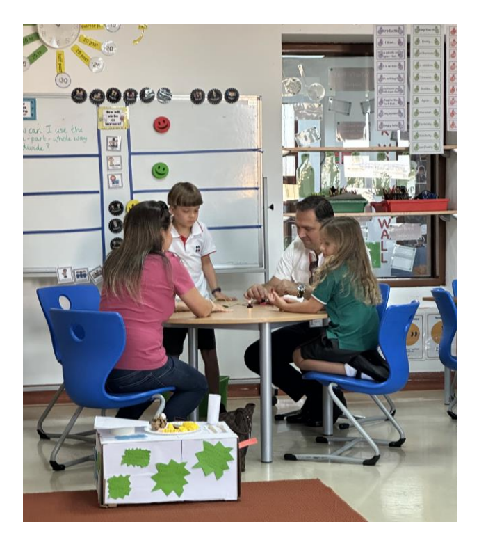
8 - Student-Led Conference.