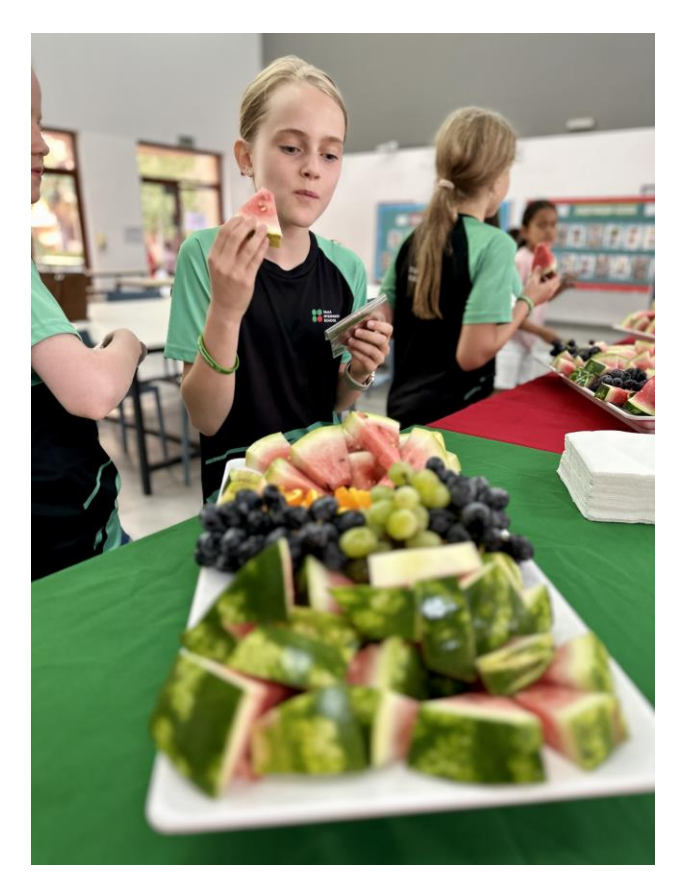
12 - A healthy snack after the awards.