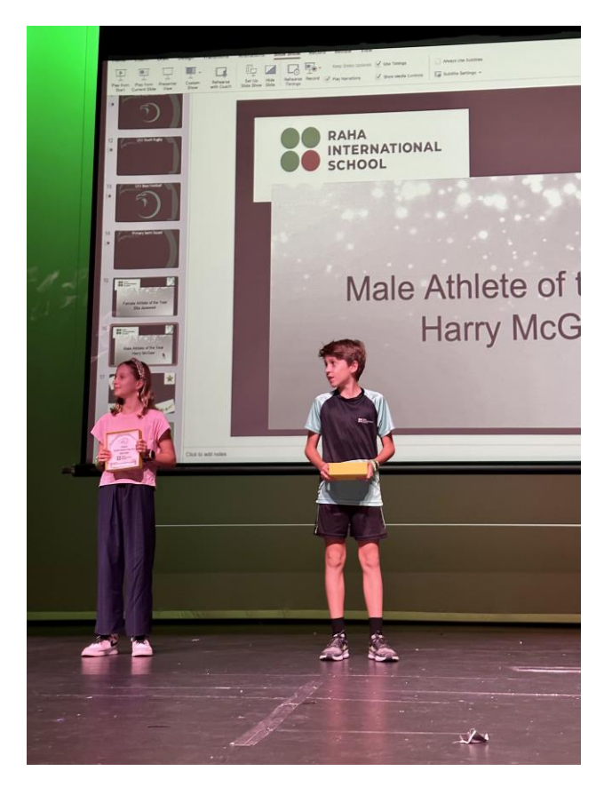
13 - PYP Athletes of the year.