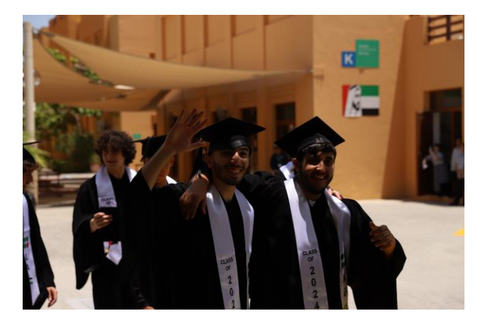
3 - We did it!