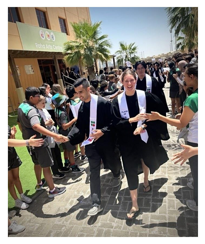
2 - Members of the SRC opening the Walk.