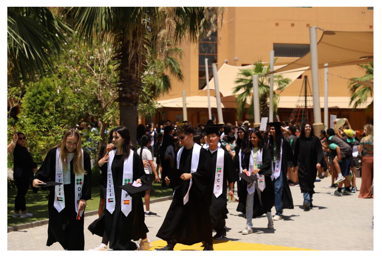
1 - First Senior Walk in Raha, let's make it a tradition!