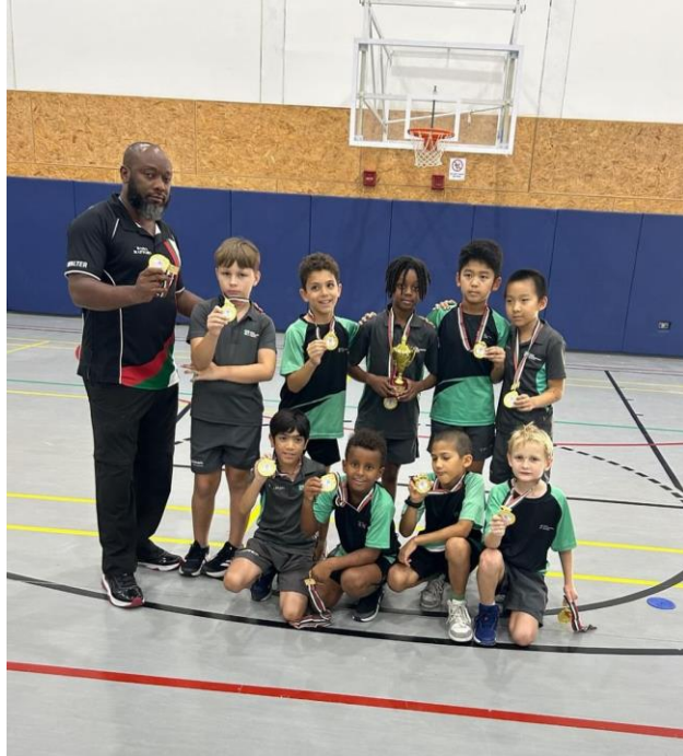
5 - Impressive undefeated run in ADISSA tournament, U9 boys basketball team winners.