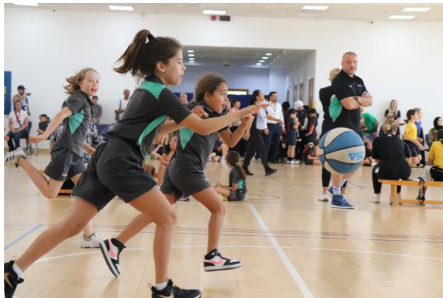
6 - First U9 Girls Basketball Tournament at Raha.