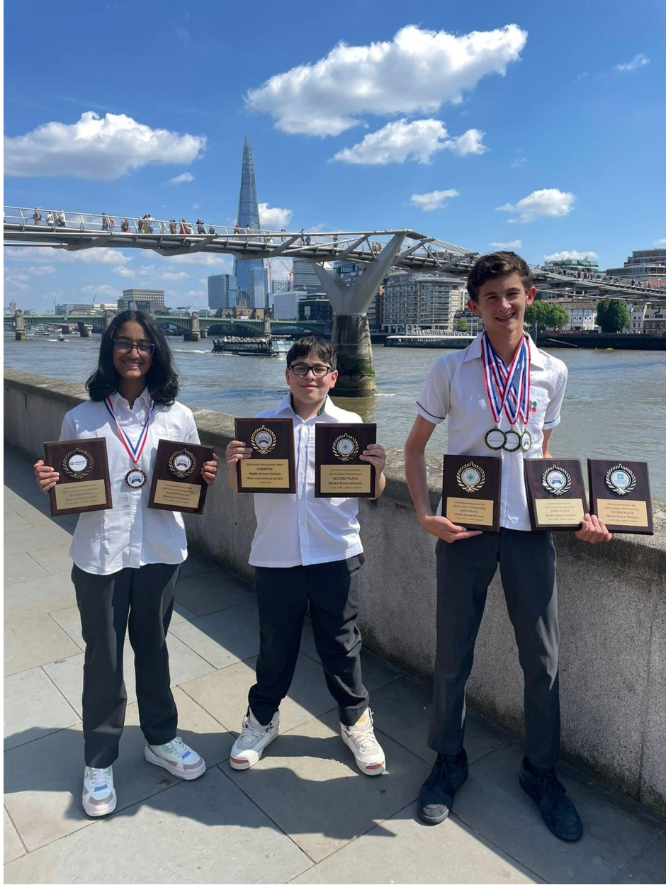
2 - Congrats to our amazing students that swept many medals in the 2024 European Championship of International Academic Competitions in London.