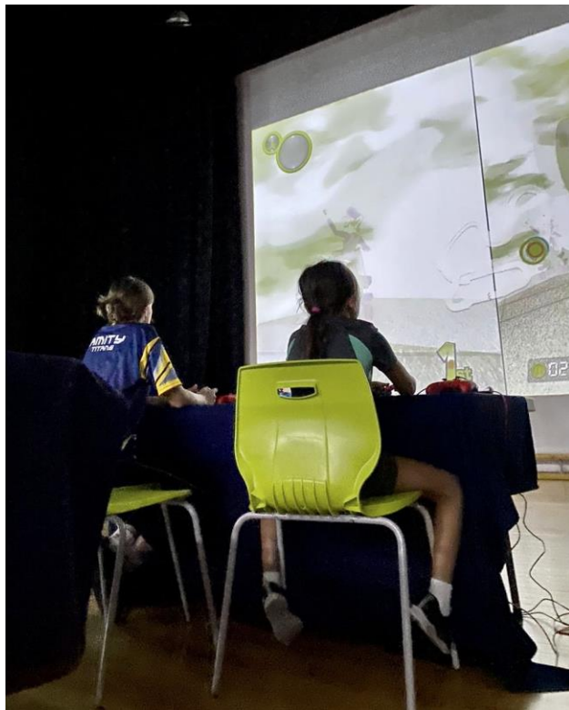
4 - Raha Esports captures its second victory against Amity at the Abu Dhabi International Schools Mario Kart League.