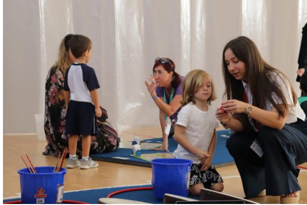
3 - "Monday Meet U" session for new EY1 Families.