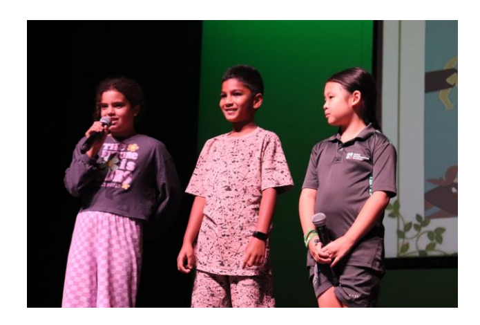
Best moments of MYP Arabic Assembly