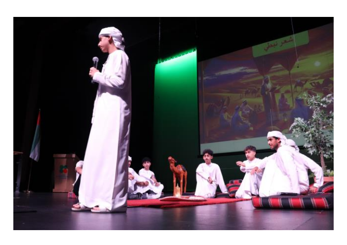
10 - Nabati Poetry