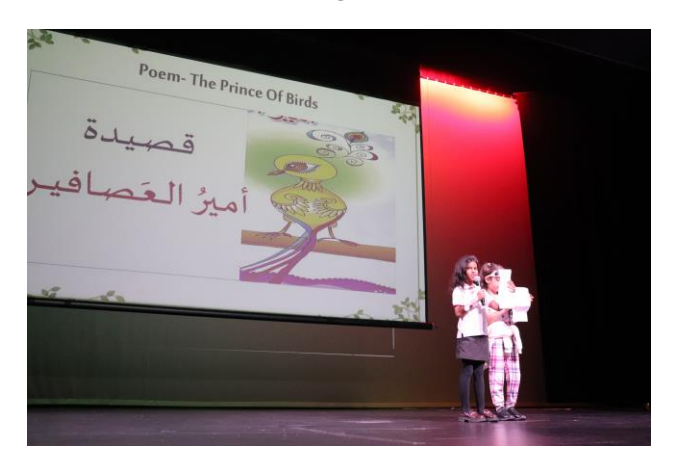
5 - A beautiful poem.