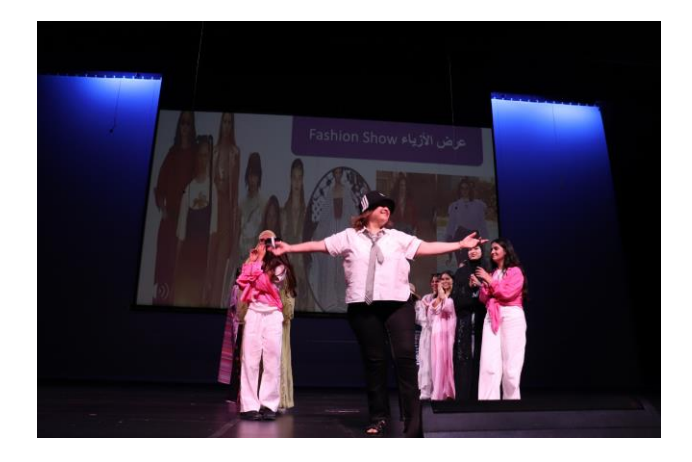
12 - Fashion Show