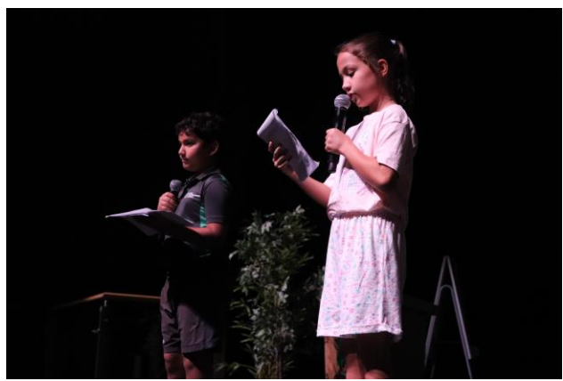
7 - Our Arabic/English hosts