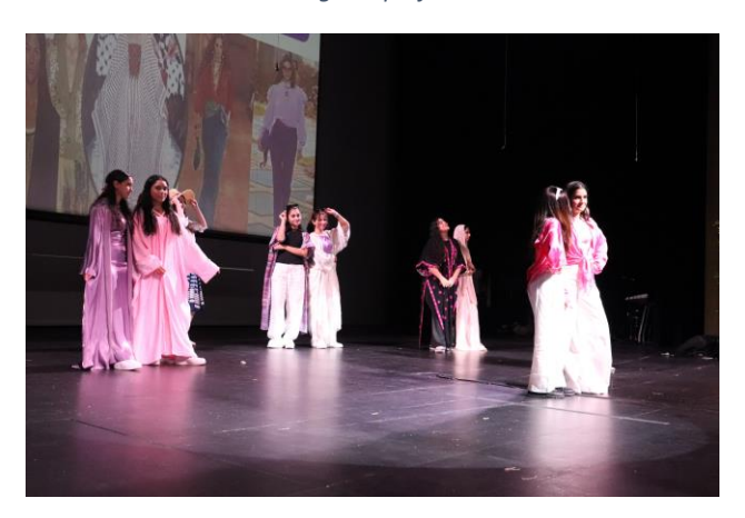
14 - Modest Fashion