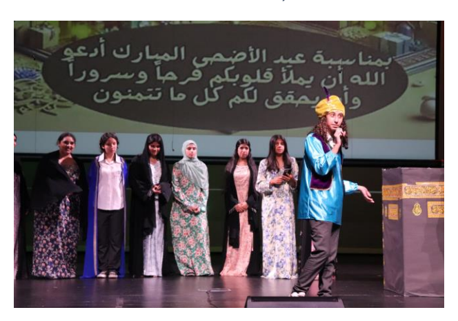
11 - Explanation of the Eid Al Adha