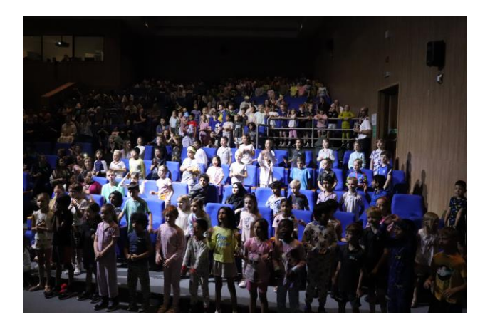
6 - G1 performance.