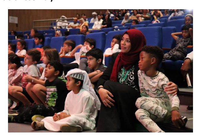
3 - Enjoying the show