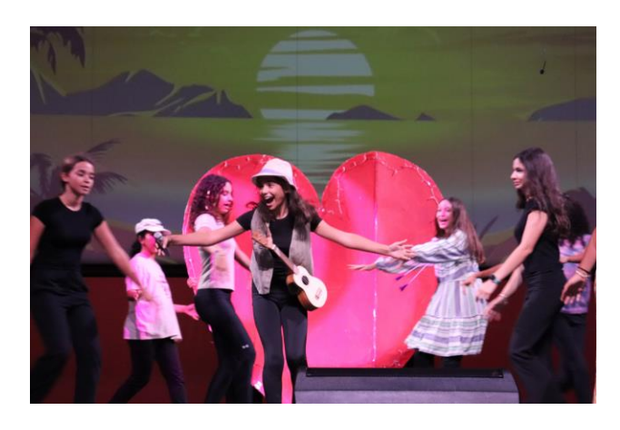
13 - Loving this performance.