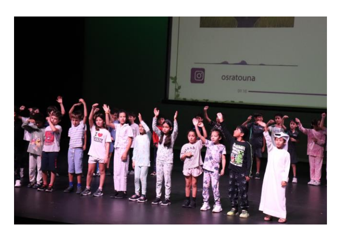
4 - Let's sing in Arabic!