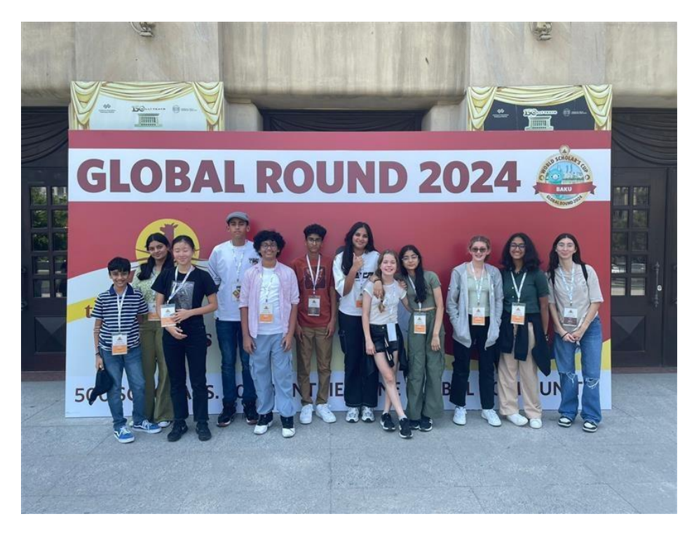
2 - Greetings from Baku!