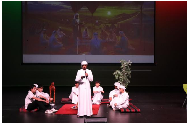
9 - Nabati Poetry